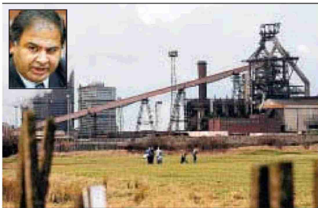
LIFELINE: The Corus Teesside Cast Products plant at Redcar which is set to resume production and, inset, the late MP Ashok Kumar